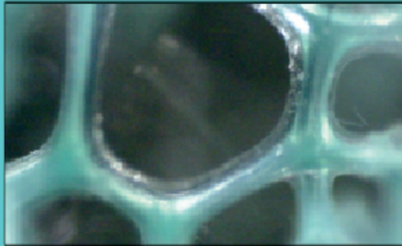
XLR8 Green Foam (Smooth Pore Edges)