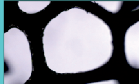
Competitors Black Foam (Sharp Pore Edges)